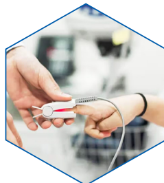
Medical Readers + Tools